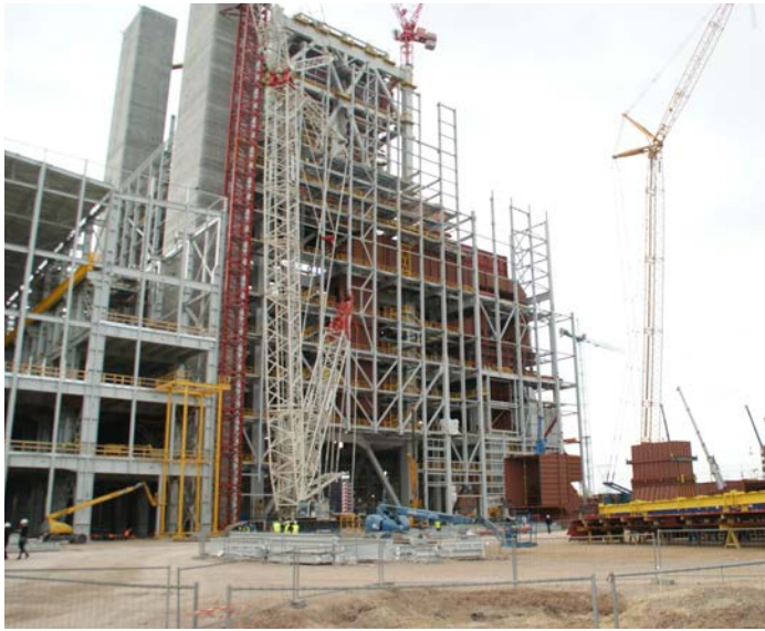
Kozenice Power Plant