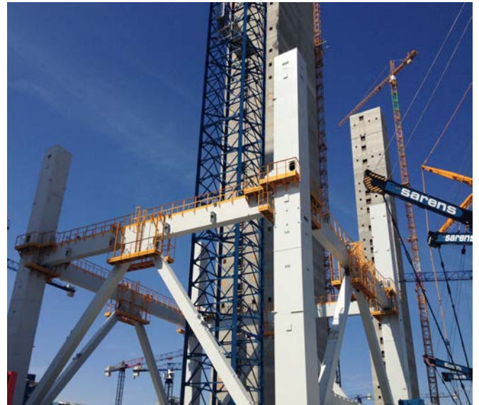
Opole Power Plant